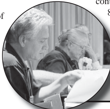
Participants at the Transforming Congregations retreat

Resurrection people who pray first, walk together and change lives